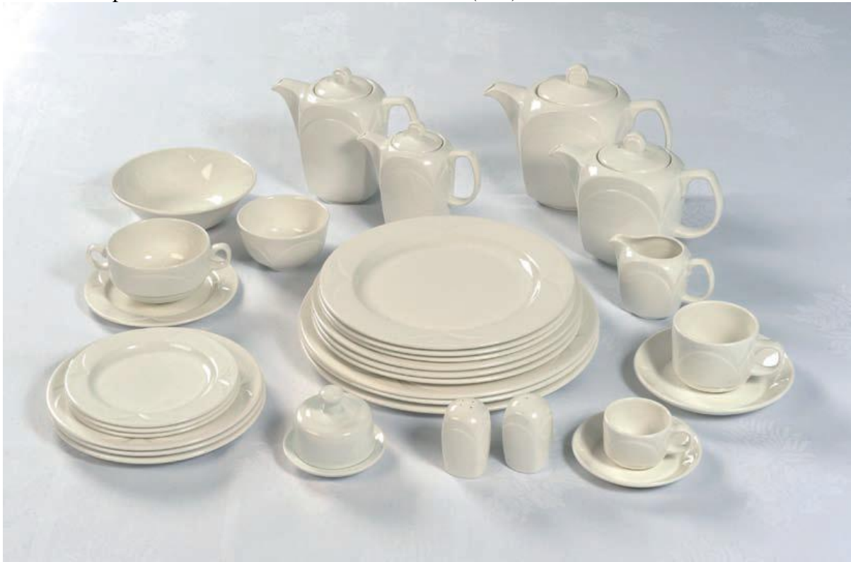
Selection of crockery – traditional style