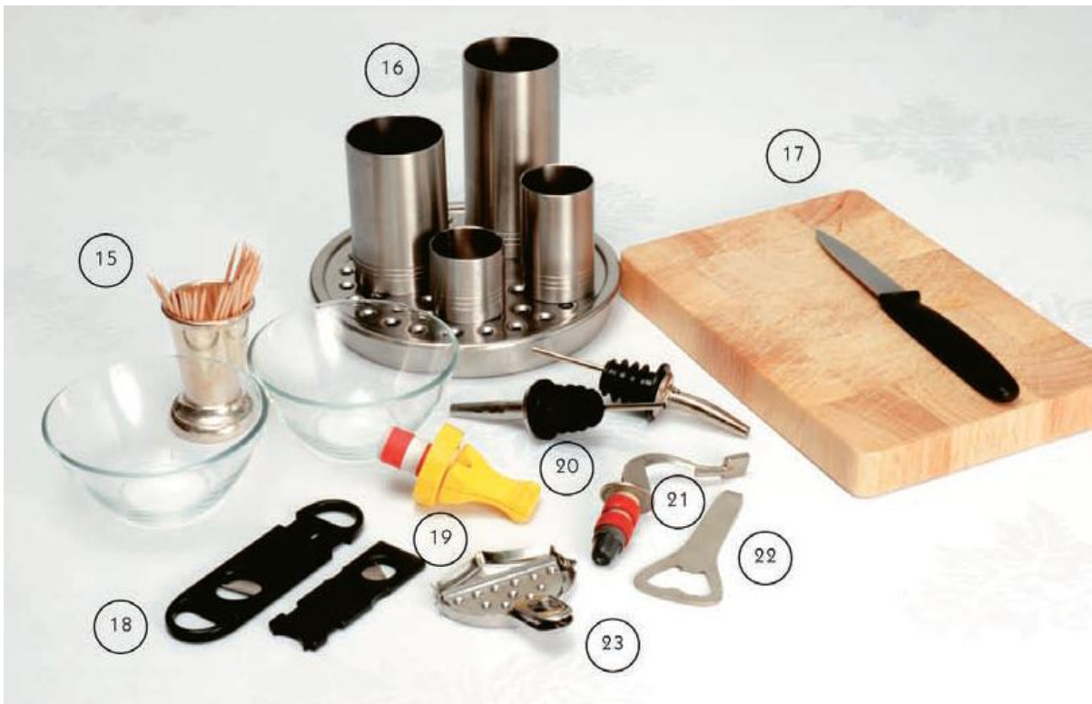
(continued) (15) appetiser bowls and cocktail stick holder, (16) measures on drip tray, (17) cutting board and knife, (18) cigar cutters, (19, 21) bottle stoppers, (20) bottle pourers, (22) crown cork opener, (23) mini juice press