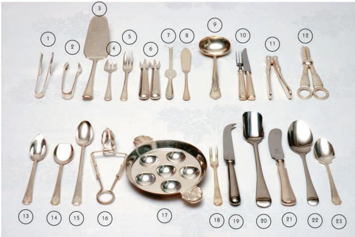
Specialised service equipment as listed in Table