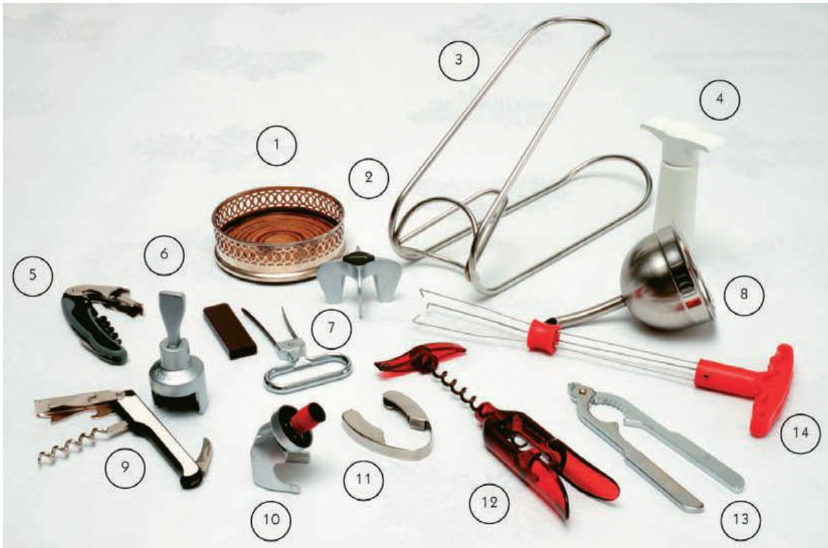
Examples of bar equipment: (1) bottle coaster, (2) Champagne star cork grip, (3) wine bottle holder, (4) vacu-pump, (5, 7, 9, 12) wine bottle openers, (6, 10) Champagne bottle stoppers, (8) wine funnel, (11) wine bottle foil cutter, (13) Champagne cork grip, (14) wine cork extractor