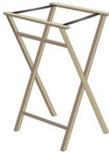
Example of a tray jack

Tables come in three main shapes: round, square and rectangular. An establishment may have a mixture of shapes to give variety or tables of all one shape depending on the shape of the room and the style of service being offered. Square or rectangular tables will seat two to four people and two tables may be pushed together to seat larger parties, or extensions may be provided in order to cope with special parties, luncheons, dinners and weddings, etc. By using these extensions correctly a variety of shapes may be obtained, allowing full use of the room and enabling the maximum number of covers in the minimum space.