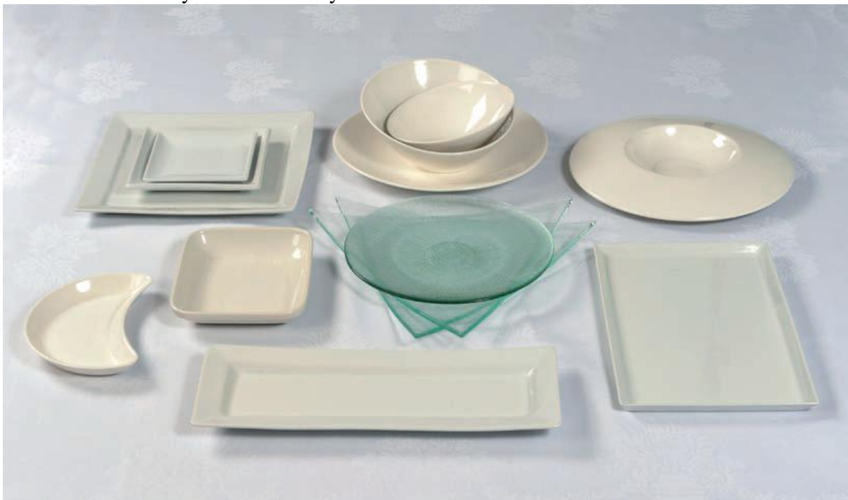
Selection of contemporary tableware