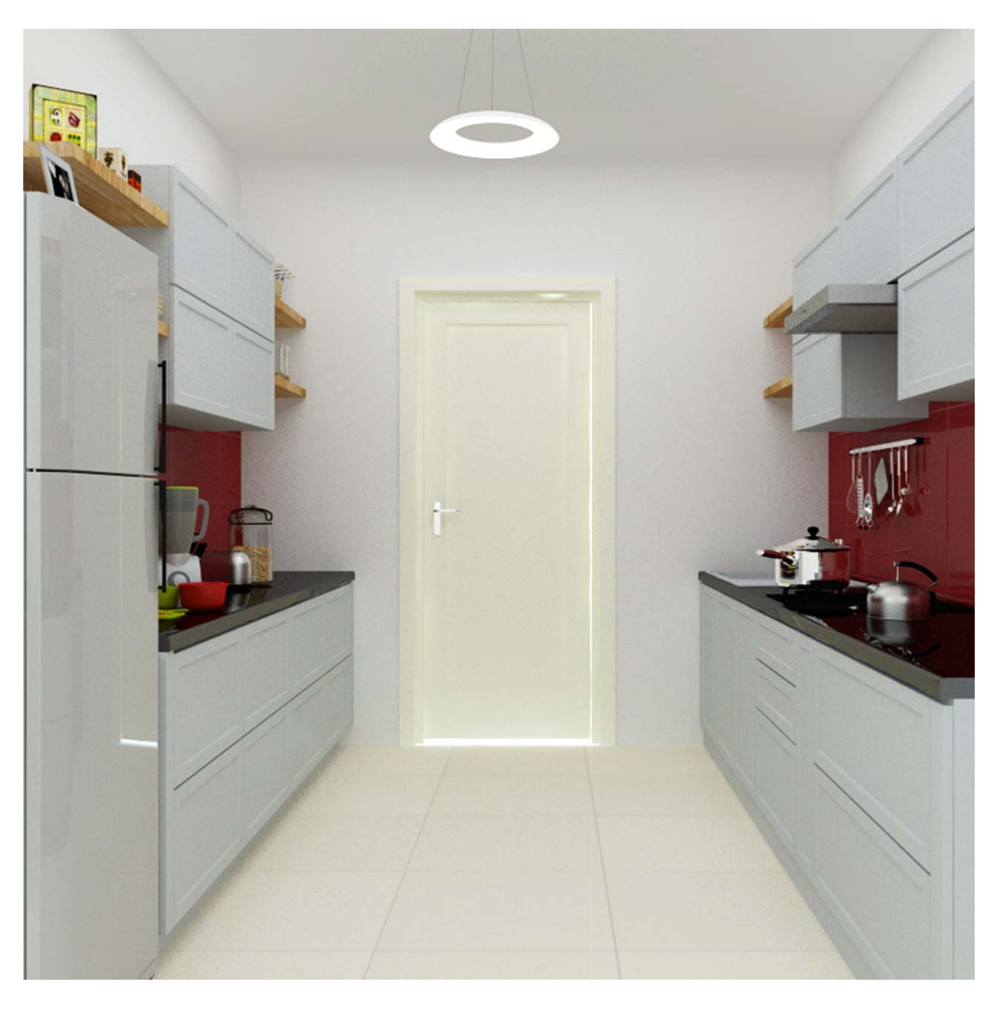
Before deciding on the layout of your new kitchen, ask yourself a couple of essential questions. What do you like about your current kitchen? What do you dislike about your kitchen? Jotting these answers down will help you crystallise on a layout that works best for you. Happy searching!

The DC Year-End Offer: Rs. 1,00,000 OFF* on Home Interiors. GET OFFER.